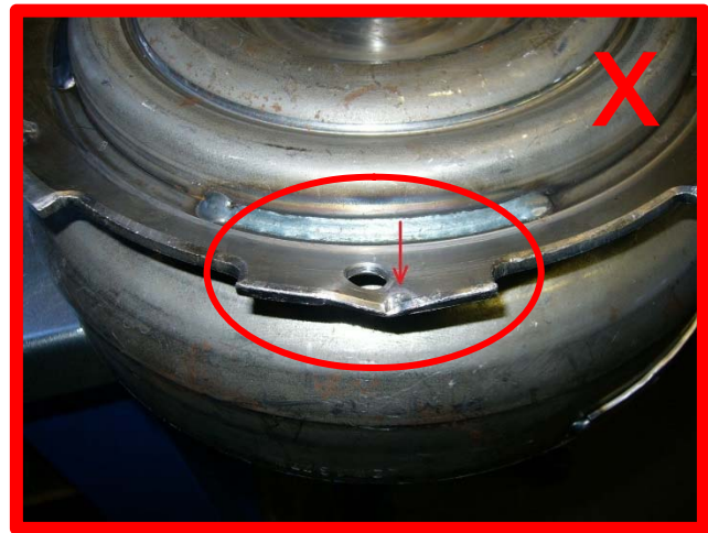
mounting rim damaged → not acceptable