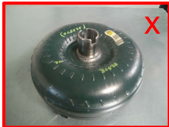
painting due to external repair / remanufacturing by 3 rd party remanufacturer → not acceptable