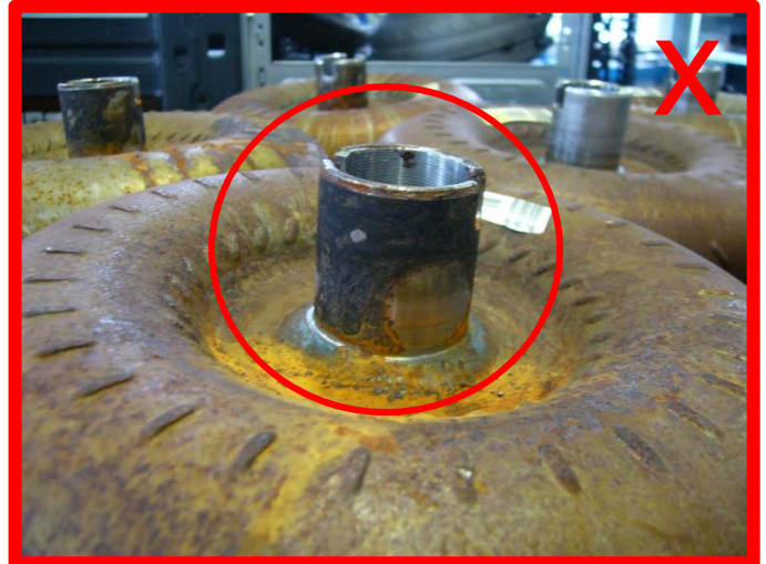
Severe corrosion, fretting corrosion (especially on hub) → not acceptable