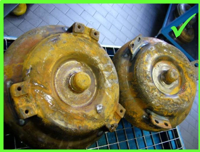
slight corrosion on surface → acceptable