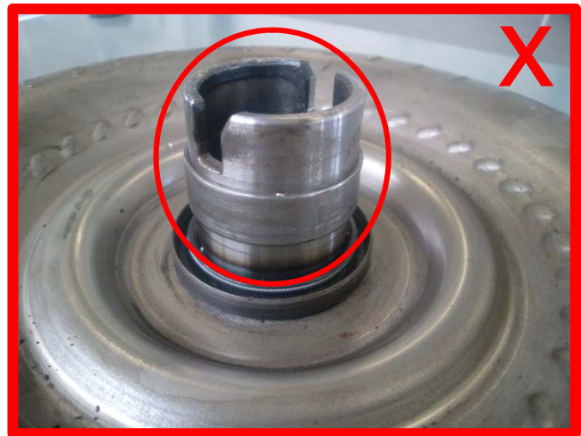
pump connector seized up on hub → not acceptable