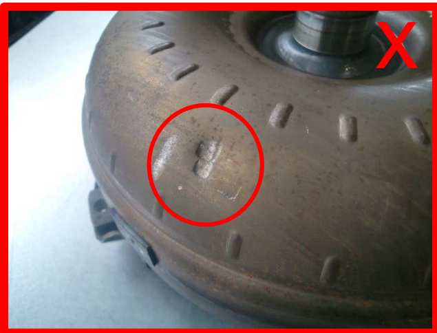
housing damaged → not acceptable