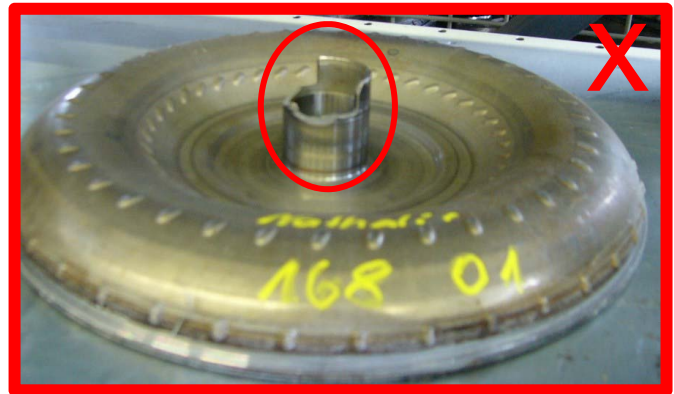
hub broken / damaged → not acceptable